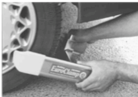
3. Slide inner and outer arms together, ensuring pointed outer arm fits into recess or hole in wheel, and push lock into nearest hole.