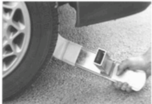
2. Position inner arm behind wheel, hook into rim.