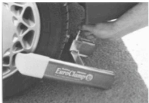
4. To remove clamp, insert key, rotate 1/2 turn, pull on key and/or press inner and outer arms together until lock pops out.

We have taken every care in the design and manufacture of this security device and we believe that it is an effective deterrent. However we cannot guarantee that it will resist the efforts of the most determined thief, and as such we do not accept any liability for loss or damage caused by theft, vandalism or other illegal activity against property to which this device is fitted.