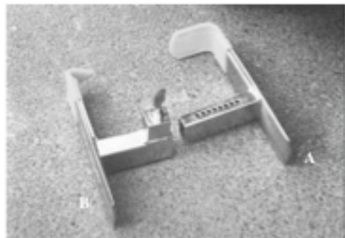
1. A - Inner Arm. B - Outer Arm.